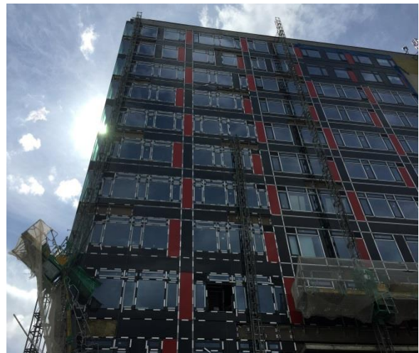
Collapsed Mast Climber

Immediate Actions: All Balfour Beatty UK projects with MCWPs in operation have arranged for new/additional Thorough Examinations to be carried out with particular attention being paid to the functioning of safety devices, limit switches, levelling switches, emergency stops, access gate switches and other associated devices.