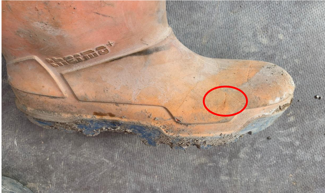
Damage sustained to the IP's boot from the jet wash.

The IP has received several stitches to the wound in his right foot and cannot currently walk without the aid of crutches.